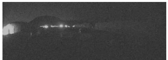
Without 180° IR