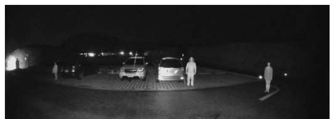
With 180° IR